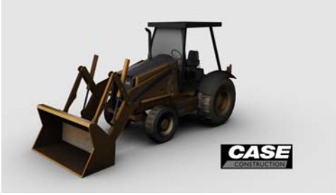
Case Construction Tractor: Polygonal construction, uv mapped and textured.