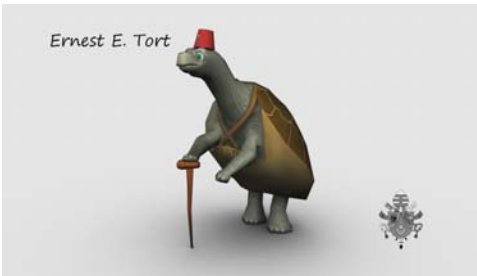
Ernest E. Tort: Quick low poly study. Poly model with 3 small textures.