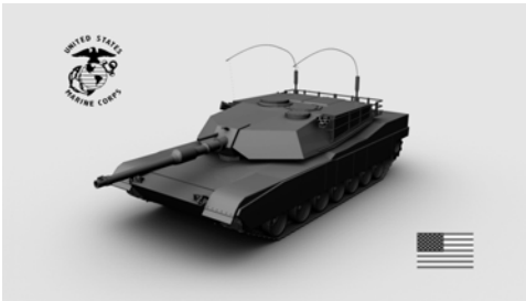
M1A1 Abrams Tank: Poly model inspired by my family and friends serving in the armed forces. Rendered shot is part of downtown San Francisco