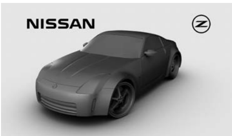
Nissan 350z: Higher res model. Built using NURBs, SubDiv and poly techniques. Textured shot rendered with mental ray.